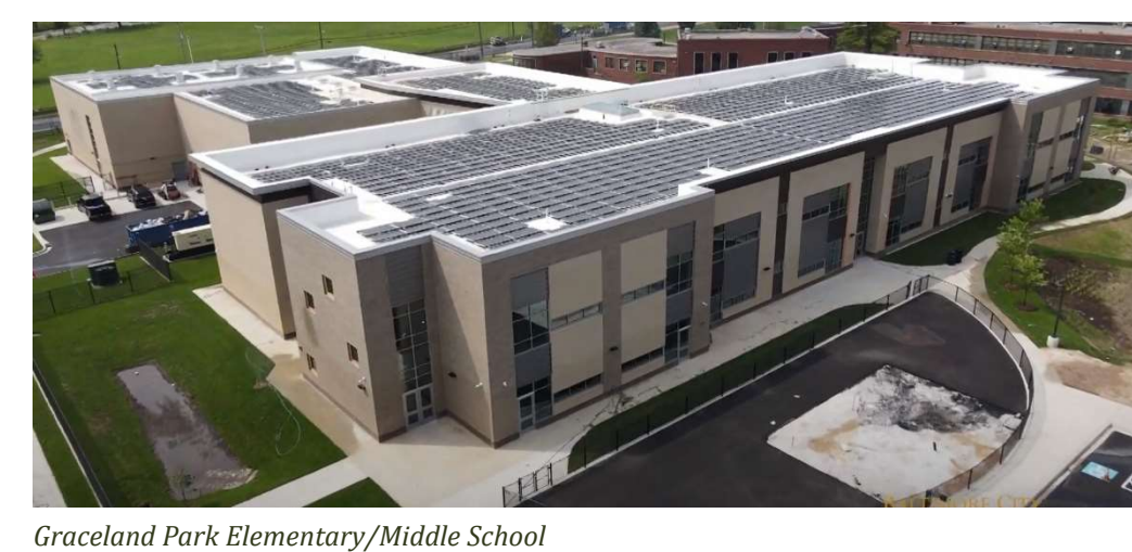
Baltimore City's First Net Zero, LEED Platinum School PV Solar, Geothermal, Green Roof Grimm and Parker Architects CAM Construction (Construction Completed September 2020) Achieved LEED Platinum in 2021