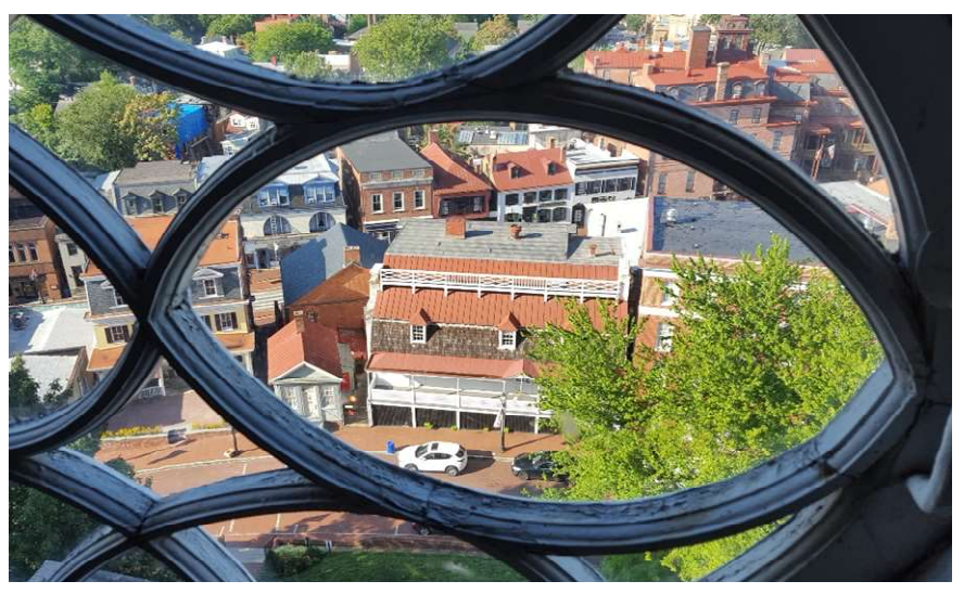
John Shaw House, Annapolis National Register of Historic Places and one of the State of Maryland's oldest facility assets – view from the State House dome.

The statutory guide for design of green buildings in Maryland is the High Performance Green Building Program. The program has been revised and updated to reference current codes and a clarified waiver process.